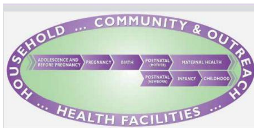
Figure - 1: RMNCH continuum of care

research scholars (PMNCH Report 2011; Navaneetham and Dharmalingam, 2002) and hence it is given prominence in the of late programmes that are developed in this regard.