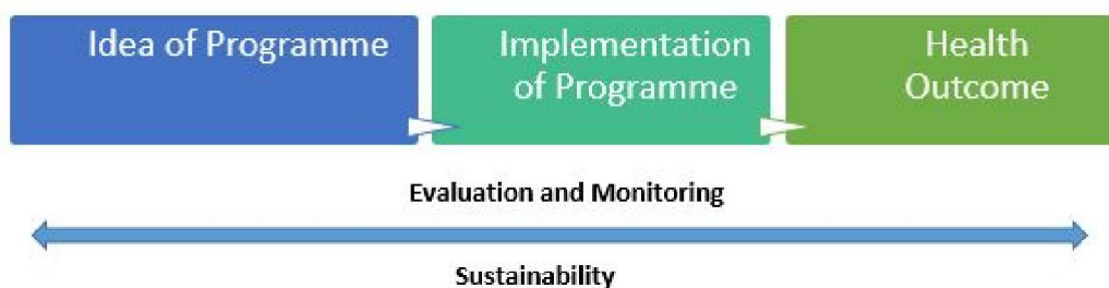
Figure: 3 – Framework for Health Programme Implementation

procedure of evaluation of any health programme can be detailed in the following framework given in figure – 3.